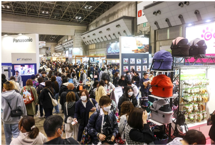
Highest-ever visitor attendance recorded at Interpets Asia Pacific 2024.

Tokyo, 25 April 2024. Interpets Asia Pacific, the leading international fair for a better life with pets in Japan, set a new attendance record this year as 67,022 visitors sourced at Tokyo Big Sight. Expanded by an additional hall at this edition, the event hosted 739 exhibitors from 14 countries and regions (567 domestic and 172 international). Overseas exhibitor numbers doubled, indicating growing international focus on Japan's pet-related product market. Across three engaging days, exhibitors from multiple categories and in various zones showcased the latest pet products and services to a variety of pet business professionals and pet owners.