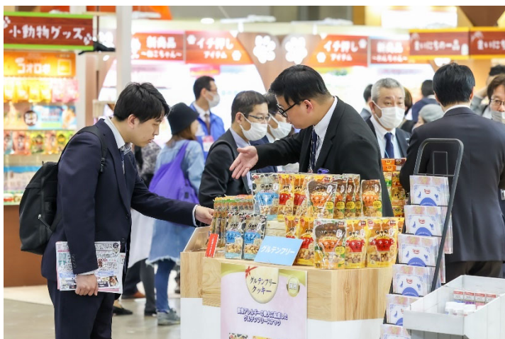
Interpets Asia Pacific 2024.

Interpets 2025 will see a strong increase of participation from companies beyond the conventional pet sector, reflecting the expanding landscape of the pet industry. Notable first-time exhibitors include Amazon Japan, Avex Live Creative Inc. (Entertainment), Bandai Namco Technica Inc. (Gaming), and SANGETSU CO., LTD. (Interior Design), along with a joint exhibition by SQUARE ENIX CO., LTD. and COMBI CORPORATION, highlighting new cross-industry initiatives that are gaining attention. Their participation underscores the increasing convergence of industries, redefining how pets and their owners experience daily life.